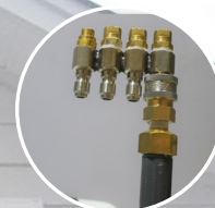
4 Tip Chem Nozzle

7 Gallons Totes are easy to manage. Store SH, other chems in the totes for easy chemical spraying.