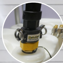
Quick Connectors at inlets and outlet

A single Sticky pint is all that is needed to mix a 50 to 70 gallon SH batches.