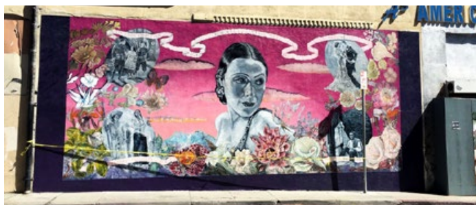
SPARC mural restoration, Hollywood CA

MURALSHIELD is designed for the protection and conservation of fine art acrylic murals. It offers UV protection, consolidation, and weatherproofing. MURALSHIELD will restore weathered, uncoated murals, and is recommended for the preservation of new acrylic and aerosol murals.