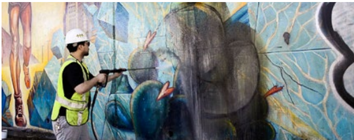
Cleaning graffiti after using MURALSHIELD in conjunction with WORLD'S BEST COATING.

Step 5 Apply two coats of WORLD'S BEST GRAFFITI COATING by spray, roller, or brush.