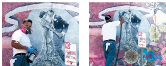
MURALSHIELD being applied with HVLP sprayer

Begin by testing MURALSHIELD on an inconspicuous section of the mural. You should see a noticeable increase in color vibrancy and luster. Allow to dry. Use adequate solvent-rated masks, protective goggles, and solvent-rated gloves.